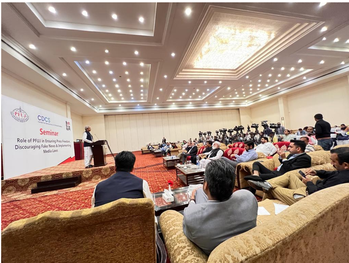
A joint PFUJ and Center for Democracy and Climate Studies (CDCS) seminar in Punjab takes place on On September 30.